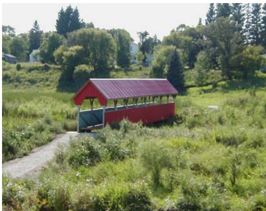
Covered Red Bridge

For more info, contact: Boyne Valley Trails Committee Ph: 723-2044