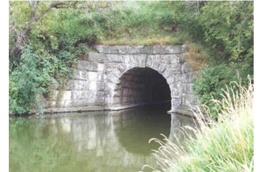
"A Scenic View" CPR Stone Archway

The Boyne Valley Nature Trail "Where Marsh and Prairie Meet"